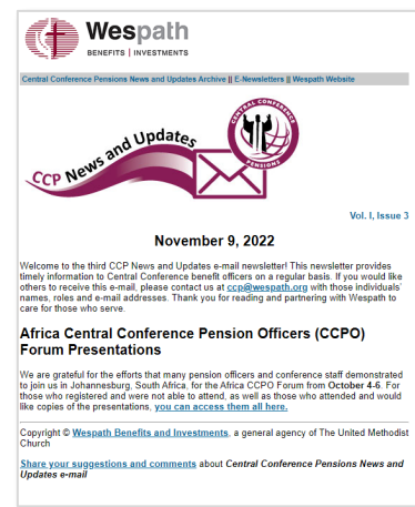
Wespath periodic communication