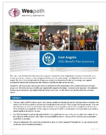
Biennial Bishop Summary Letters